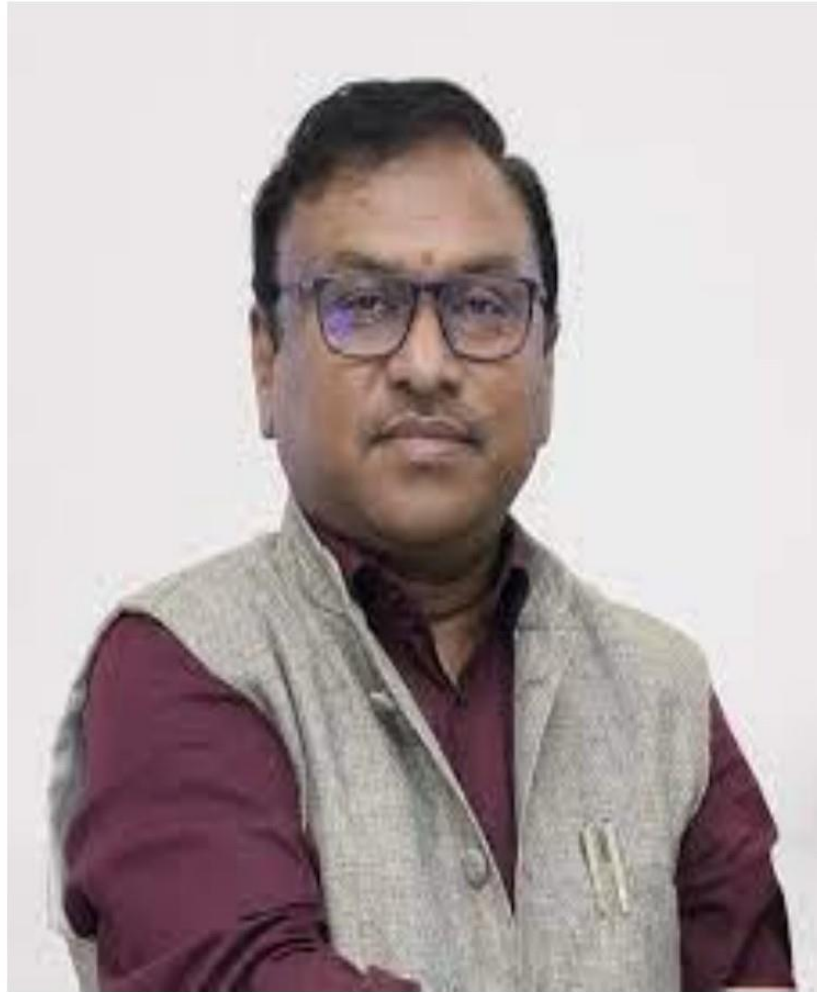
Dr. POLA BHASKAR, IAS Commissioner Collegiate Education, Andhra Pradesh

The great personality who is behind all the activities of the college